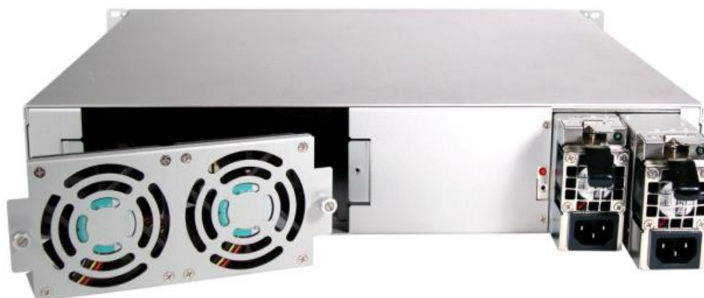
Figure 4.1. Replaceable modules in an F1800 Series device.

The F1800 Series device allows the on-site replacement of both fan and power supply modules.