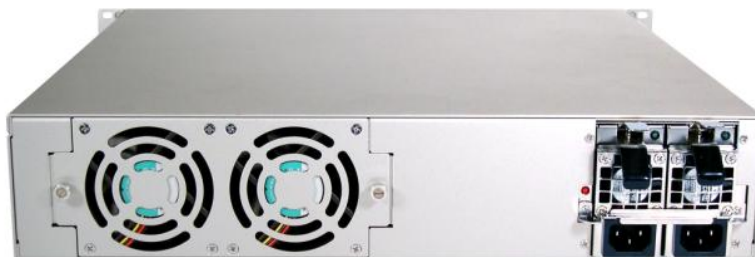
Figure 2.5. Rear view of the Amaranten F1800 Series.

If only one of the two power supplies is properly connected then a power supply failure will be assumed and a high pitched continuous alarm will sound when the Amaranten Security Gateway is switched on. For more details on power supply failure and hot-swapping F1800 Series supplies see Section 4.1, “Replacing the Power Supply”.