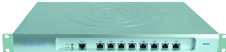
Figure 1.1. Front view of the Amaranten F300 Series.

The F300 features an RS232 console port as the first port. Besides this are 6 Fast Ethernet ports which can operate at 10Mb or 100Mb speeds. These ports are referred to by the administrator using logical interface names. All the ports are marked as LAN1 to LAN6 . They are 100Base-T or 10Base-T capable. The default name of each interface is LAN1 , LAN2 ... LAN6 .