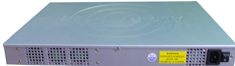
Figure 2.1. Rear view of the Amaranten F300 Series.

The image below shows the back of the F300 Series. To the extreme right is the power cord socket. To the left of the socket is a recessed button for resetting the device to factory defaults.