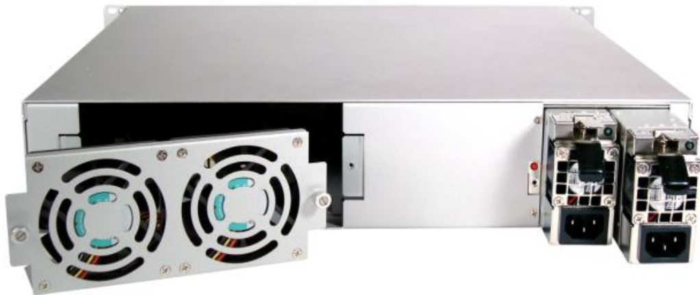
Figure 4.1. Replaceable modules in an F5000 Series device.

The F5000 Series device allows the on-site replacement of both fan and power supply modules.