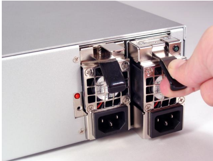
Figure 4.2. Replacing a F5000 Series power supply.