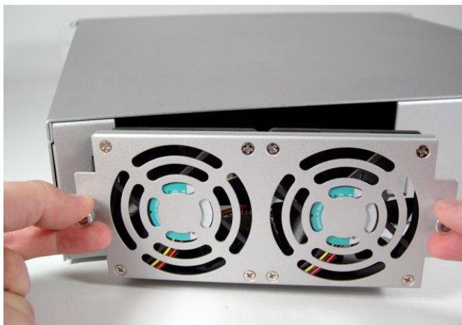
Figure 4.6. Amaranten F5000 Series fan disassembly.