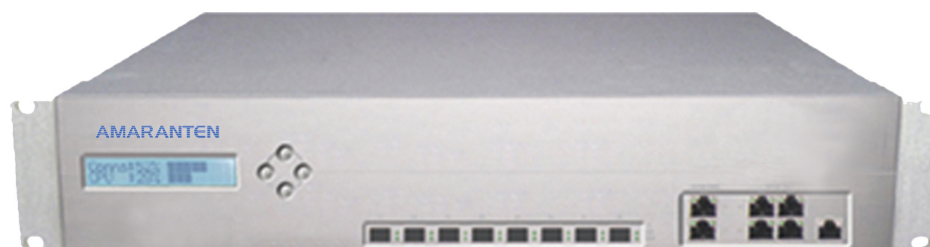
Figure 1.1. Front view of the Amaranten F5000 Series.

The device features a number of connection ports. On the far right is the RS232 console port. On the far left is the device's display and keypad. Between are an array of 14 Ethernet ports.