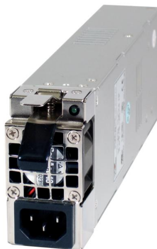
Figure 4.3. An F600 Series AC power supply unit.

The high pitch alarm indicating power supply failure is deliberately intrusive. To switch it off, press in the small red switch which is recessed into the F600 Series casing. This is located just to the left of both power supplies as shown in the above image. Switching the alarm off will not, in any way, alter the status of either power supply.