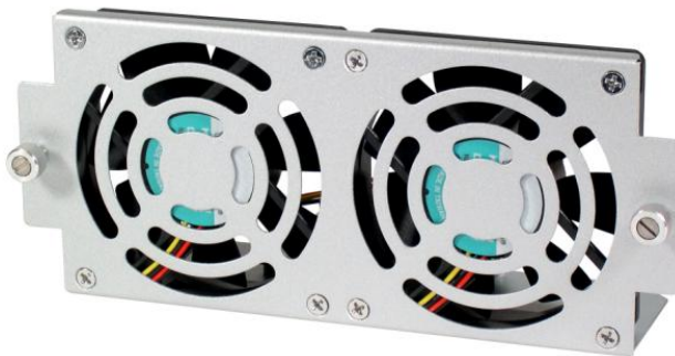
Figure 4.5. An F600 Series fan module.

The fan module in a F600 Series device is liable to wear from mechanical movement and fan failure can lead to much more serious failures from overheating of electronic components. Although the fan modules are built for prolonged use it is nonetheless a recommended precaution that the fan module (shown below) be replaced every two years.